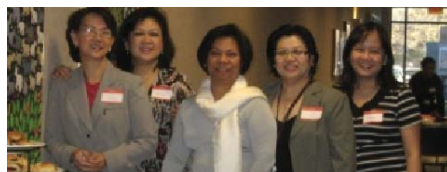
PNANJ Somerset County Sub-Chapter Officers