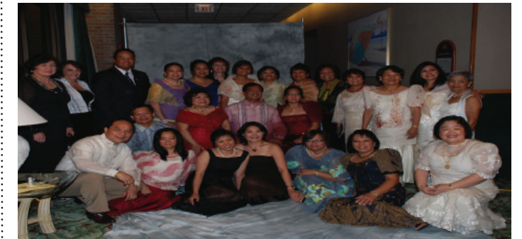
South Padre Island, Texas was the venue of the recently held 29th Annual PNAA Convention, July 16-2008. This year's theme: Power the Passion for Nursing: Clinical Excellence, Technology, Commitment, Professional Dedication and Community Involvement.

The last day was a farewell picnic for those who were free, some had to come back home early, while others took the opportunity to visit Progresso, Mexico for some shopping. It was a fun-filled 5 day convention. Hurricane Dolly may have washed away our footprints but the friendship and memories we had at South Padre will live on. Viva PNANJ!